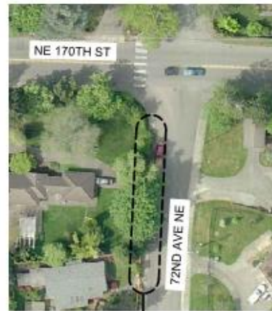
SIDEWALK AND DRIVEWAY RECONSTRUCTION