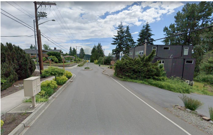
Figure 2: After Project Completion