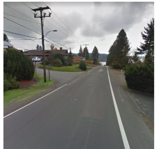
Figure 3: Preexisting Condition