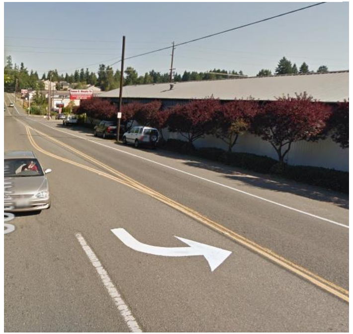
Figure 3: Previous Condition