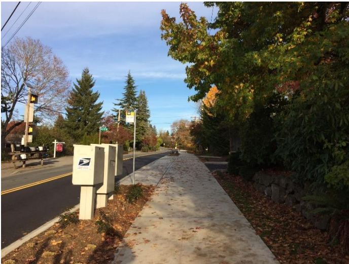
Figure 1: Improvements

Background: The south side of NE 153 Place previously consisted of 2 to 6-foot+ wide shoulders for pedestrian use. NE 153 Place NE is a designated walking route for Arrowhead Elementary School students. Sidewalks along this road were identified as a priority during the neighborhood meetings held for this area as part of the Neighborhood Transportation Program Plan. In 2016, the City applied for a Washington State Department of Transportation's (WSDOT) Safe Routes to School program grant to fund this project. In June 2017, WSDOT notified the City that this project was awarded grant funds to complete the sidewalk improvements.