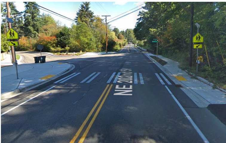
Figure 1: Improvements

Background: The improvements along the project corridor helped the City of Kenmore take another step towards completing the key pedestrian corridor linking the central business district, neighborhoods, and Kenmore Junior High School. The City of Kenmore conducted a study in 2008 of the 68 th Avenue NE/202 nd Street corridor, which extends both to the south and north of the proposed project area and identified it as a key pedestrian safety corridor.