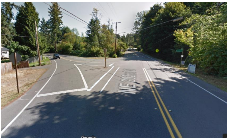
Figure 3: Previous Conditions