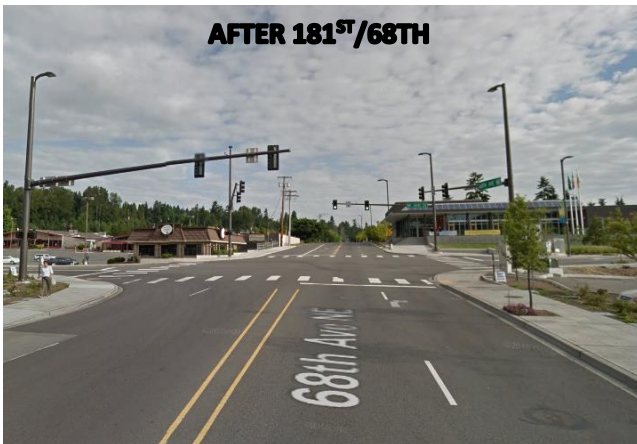
AFTER 181 ST /68TH

The Washington State Department of Transportation (WSDOT) had identified this section of SR522 as a high accident corridor and high accident location with three pedestrian accident locations at the intersections of 61 st , 73 rd , and 80 th Avenues. Three of the twelve highest pedestrian accident locations in WSDOT's Northwest Region (King, Snohomish, Skagit and Whatcom counties) were located on SR522 in Kenmore.