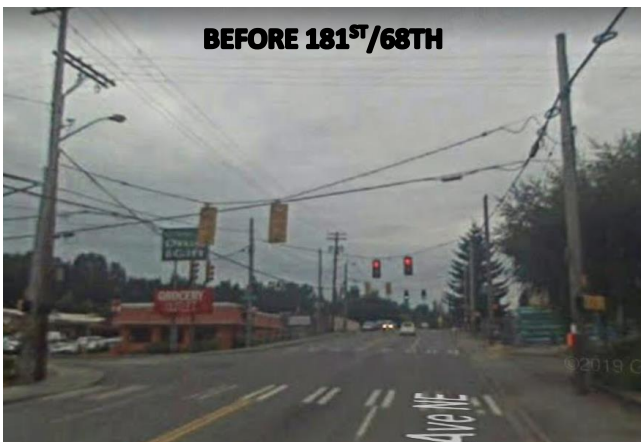
BEFORE 181 ST /68TH